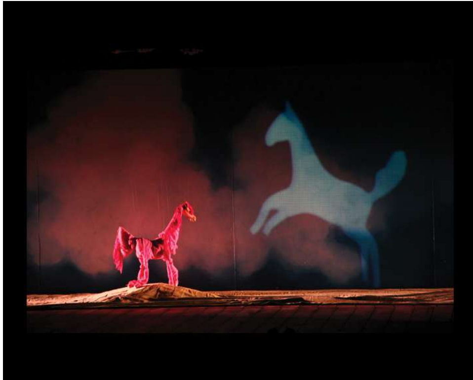
Ballad of the Wild Horses, 2003 © Carte Blanche (compagnie Irina Niculescu)