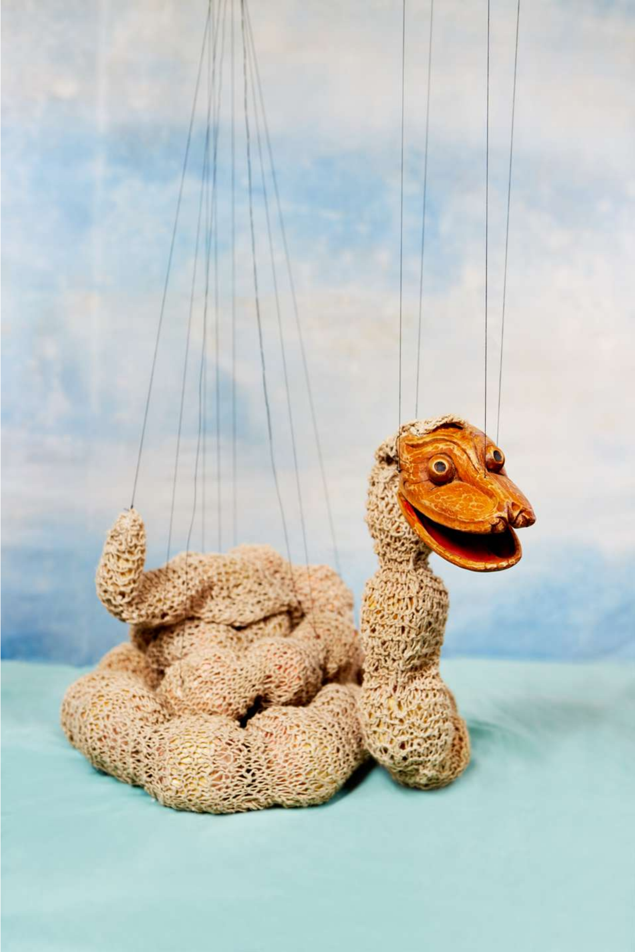
Ballad of the Wild Horses 2019 - The Snake © Michel Pinault